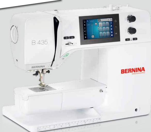
B 435 and B 475 QE

Talented. Energetic. Creative. Bold. A maker like Tiffany relies on the B 435 and B 475 QE to be powerful, easy to handle, fast and magical. Day in and day out. And her BERNINA never fails to deliver. She loves it and you will too.