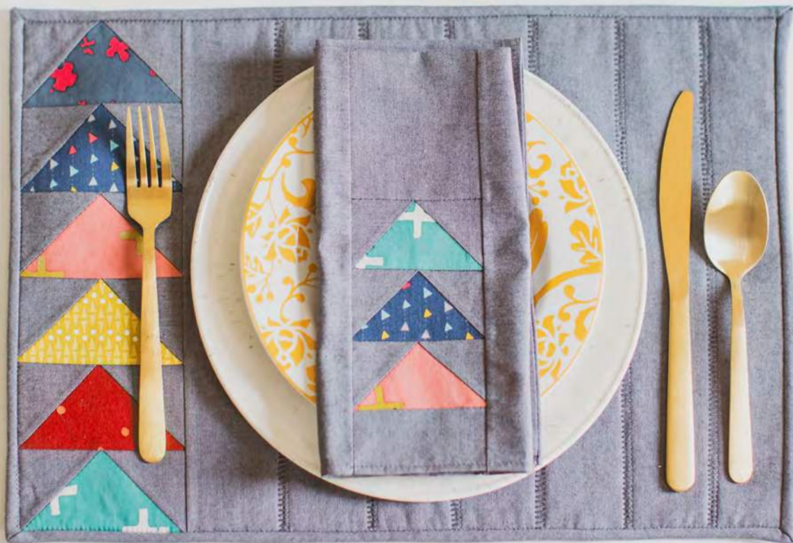
Chris Tryon • "Flying Geese for Supper"