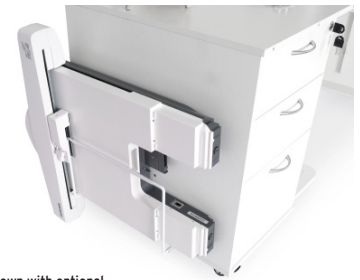
Shown with optional embroidery arm storage rack