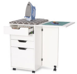
Kiwi Storage Cabinet

Every dream sewing oasis needs its cute, dependable accessories! Add even more convenience with a storage cabinet like Kiwi , featuring a built-in ironing board, cutting mat, thread drawers and a dedicated drawer to store your iron! Your dream sewing space won't be the same without it!