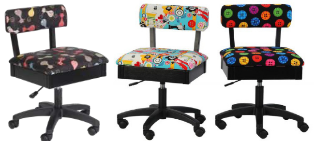
Cat's Meow, Sew Wow Sew Now & Bright Buttons Chairs

The cherry on top of your sewing sundae! Arrow's #1 Rated Height Adjustable Sewing Chair is a must have accessory for your dream sewing room! Cute, comfortable and convenient - our lovable chairs feature vibrant sewing themed patterns, 360° swivel access and lumbar support for long hours at your workstation. Don't look now, but under every seat cushion is a hidden storage compartment to store your notions and patterns! Available in 10 colors to perfectly match your sewing sanctuary!