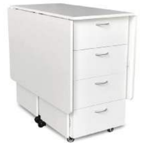
Kookaburra Cutting Table

Every dream sewing oasis needs functional, dependable accessories! Add even more convenience with a cutting table like Kookaburra , featuring two fold out leaves, four self-closing drawers, four rear removable shelves, and locking casters for easy mobility! Your dream sewing space won't be the same without it!