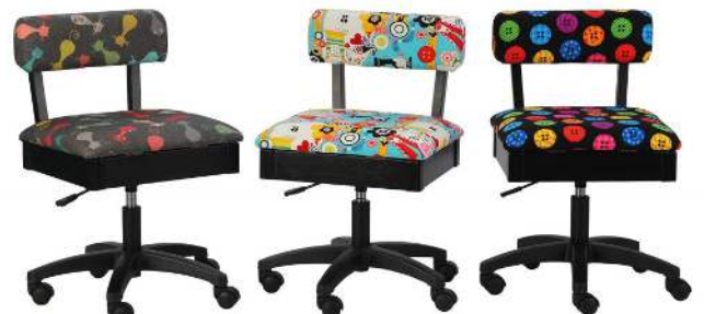
Cat's Meow, Sew Wow Sew Now & Bright Buttons Chairs

The cherry on top of your sewing sundae! Arrow's #1 Rated Height Adjustable Sewing Chair is a must have accessory for your dream sewing room! Cute, comfortable and convenient - our lovable chairs feature vibrant sewing themed patterns, 360° swivel access and lumbar support for long hours at your workstation. Don't look now, but under every seat cushion is a hidden storage compartment to store your notions and patterns! Available in 10 colors to perfectly match your sewing sanctuary!