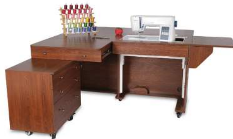
Kangaroo & Joey Sewing Cabinet

Kangaroo sewing cabinet - check! Now complete your studio with Kangaroo storage and cutting furniture, specially designed to complement your primary workstation. With extra storage and workspace, you can customize your sewing room to be stylish, comfortable, and even more productive!