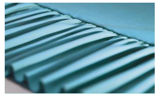
Full-Featured Single Unit Differential Feed We've taken the differential feed to a new level by adding a single-unit feed dog mechanism. This ensures stronger feeding as well as consistent gathering on all fabrics.

RevolutionAir™ Looper Threading Insert thread into one of the Acclaim's threading ports, push the button and a gust of air quickly pushes it through the patented tubular loopers, exactly where you need it every time. Tangles, knots and breakage are now a thing of the past!