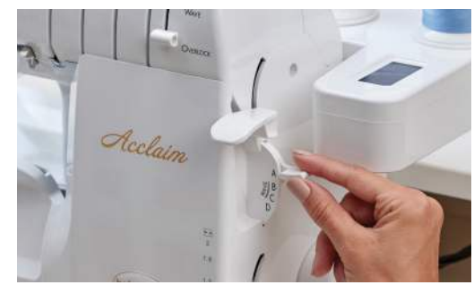
Automatic Thread Delivery System Set the Acclaim to the type of stitch you want and never worry about tension adjustments again. Enjoy perfectly balanced stitches regardless of the type of fabric you're using. And ATD lets you thread your loopers in any order.