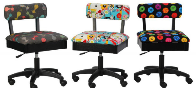
Cat's Meow, Sew Wow Sew Now & Bright Buttons Chairs

The cherry on top of your sewing sundae! Arrow's #1 Rated Height Adjustable Sewing Chair is a must have accessory for your dream sewing room! Cute, comfortable and convenient - our lovable chairs feature vibrant sewing themed patterns, 360° swivel access and lumbar support for long hours at your workstation. Don't look now, but under every seat cushion is a hidden storage compartment to store your notions and patterns! Available in 10 colors to perfectly match your sewing sanctuary!