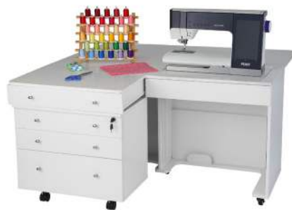
Kangaroo & Joey II Sewing Cabinet

Kangaroo sewing cabinet - check! Now complete your studio with Kangaroo storage and cutting furniture, specially designed to complement your primary workstation. With extra storage and workspace, you can customize your sewing room to be stylish, comfortable, and even more productive!