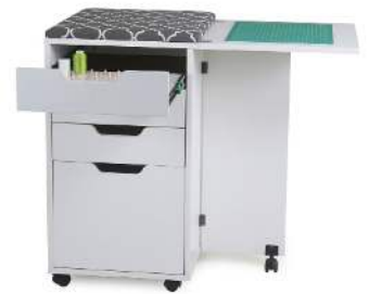
Kiwi Storage Cabinet

Every dream sewing oasis needs functional, dependable accessories! Add even more convenience with a storage cabinet like Kiwi , featuring a built-in ironing board, cutting mat, thread drawers and a dedicated drawer to store your iron! Your dream sewing space won't be the same without it!