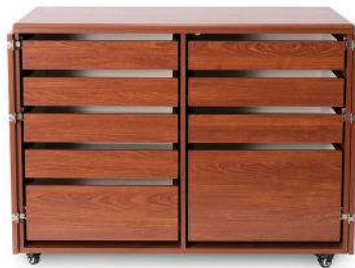
Dingo Cutting Table

Kangaroo sewing cabinet - check! Now complete your studio with Kangaroo storage and cutting furniture, specially designed to complement your primary workstation. With extra storage and workspace, you can customize your sewing room to be stylish, comfortable, and even more productive!