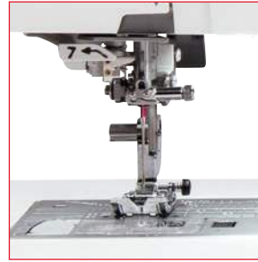
Superior Needle Threader with #7 Thread Path