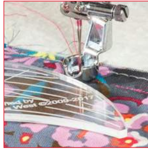
Ruler Quilting Function