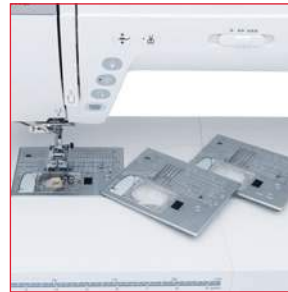
3 One-Step Quick Change Needle Plates