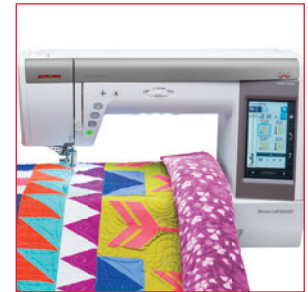
11" Bed Space