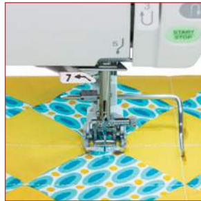
Detachable AcuFeed™ Flex Layered Fabric Feeding System