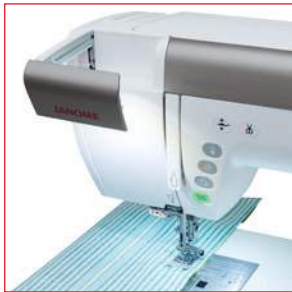
Full Intensity Lighting System